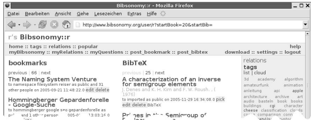
Figure 1. BibSonomy displays bookmarks and bibliographic references simultaneously.

As folksonomies have three dimensions which are completely symmetric, one can establish minimum support thresholds on all of them. The general problem of mining frequent tri-sets is then the following: