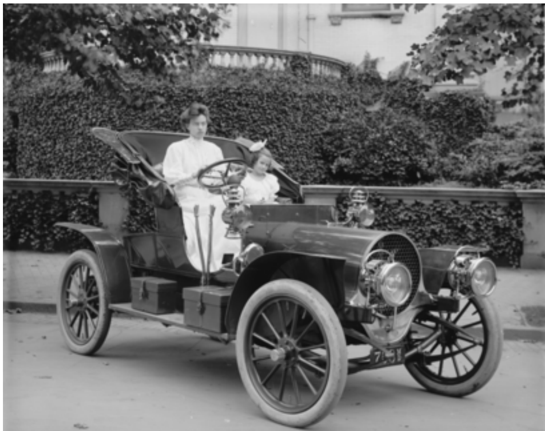
Figure 1: 1907 Franklin Model D roadster. Photograph by Harris & Ewing, Inc. [Public domain], via Wikimedia Commons. ( https://goo.gl/VLCRBB ).

example, however we only output the series if the volume number is given [8] (so series should not be present since it has no vol. no.), a chapter in a divisible book [9], a chapter in a divisible book in a series [10], a multi-volume work as book [11], an article in a proceedings (of a conference, symposium, workshop for example) (paginated proceedings article) [12], a proceedings article with all possible elements [13], an example of an enumerated proceedings article [14], an informally published work [15], a doctoral dissertation [16], a master's thesis: [17], an online document / world wide web resource [18, 19, 20], a video game (Case 1) [21] and (Case 2) [22] and [23] and (Case 3) a patent [24], work accepted for publication [25], prolific author [26] and [27]. Other cites might contain 'duplicate' DOI and URLs (some SIAM articles) [28]. Multi-volume works as books [29] and [30]. A couple of citations with DOIs: [31, 28]. Online citations: [32, 18, 33, 34].