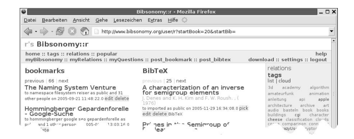
Figure 1. BibSonomy displays bookmarks and bibliographic references simultaneously.

Definition 1. Let \mathbb{F}:=(U,T,R,Y) be a folkson-omy/triadic context. A tri-set of \mathbb{F} is a triple (A,B,C) with A\subseteq U, B\subseteq T, C\subseteq R such that A\times B\times C\subseteq Y .