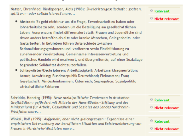
Figure 1: Screenshot of the web-based assessment tool. The users were shown the name and description of the task (top) and a number of documents to assess. The documents (middle) had author, publication year, title, abstract and keywords, which the assessors could use to judge the documents relevant or non-relevant (right).

Suchen Sie Forschungsarbeiten und -veroeffentlichungen zu Armut in Deutschland