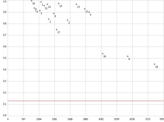
Figure 4. An exemplary nt-plot for the location Brandenburgertor, for tags with a maximum distance of 5km. Tags that were used more often are shown on the right side of the diagram, for example, "streetart" (16), "graffiti" (8), or "urban" (18). Tags that are very specific for the given target concept, that is, within a 5km area of the Berlin Brandenburger Tor, are displayed at the top of the diagram. For example, the tag "urban" (18) was used relatively often, but it is not specific for the specified location of interest. However, tags such as "heinrichböllstiftung" (10), "alexanderplatz" (1), or "potsdamerplatz" (14) are very specific (and interesting) for the specified location.