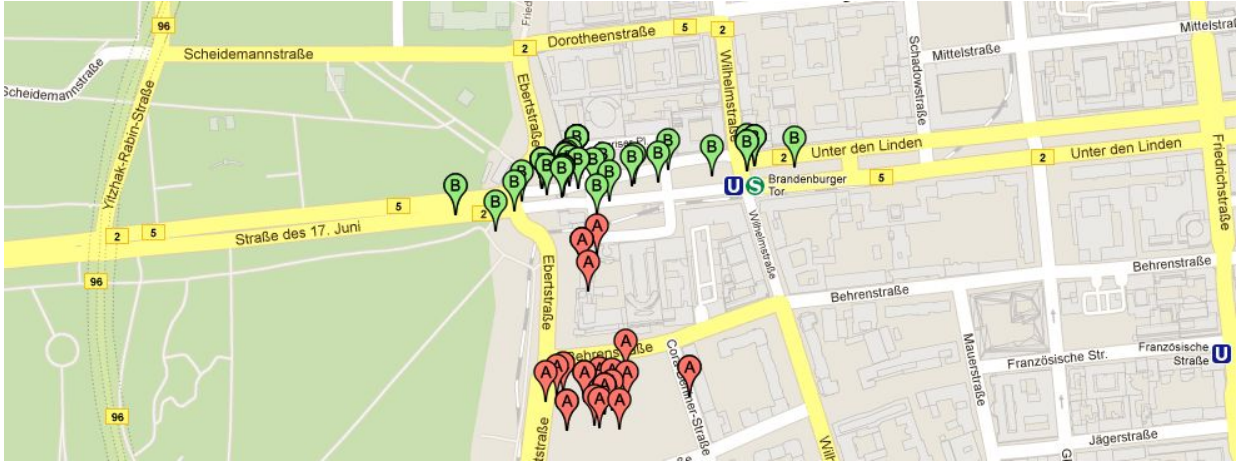
Figure 2. Example comparative Tag-Map visualization from the case study (zoomed in): Pictures with tag "brandenburgertor" are marked with a red "A", while pictures for the tag "holocaust" are marked with a green "B"